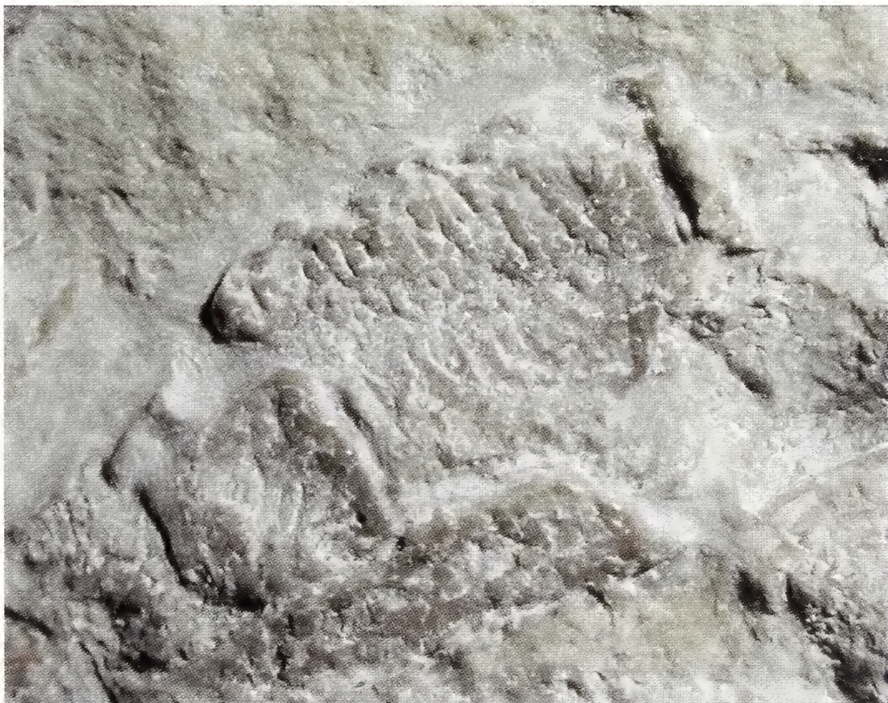
Fig. 6 – Striadiogenes frigerioi n. gen., n. sp., detail of ornamentation of merus of P2 / dettaglio dell'ornamentazione del merus di P2 (x 9).